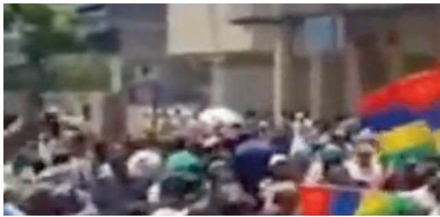
Protest march in Port Louis on 13.2.21

Well, in face of all this, a well-advanced country like Mauritius cannot be outdone. The wrecking of the Japanese