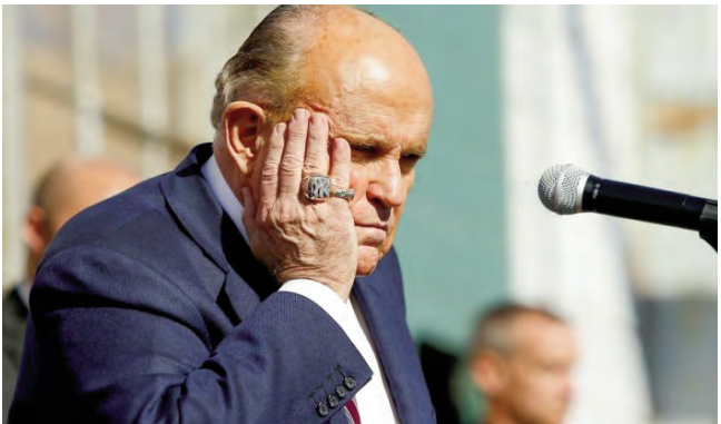
What have I done? Is R. Giuliani, a Trump lawyer, remorseful?