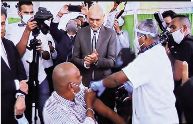
The first Mauritians to be injected against the Covid-19 earlier in February were the frontliners namely in the medical profession.