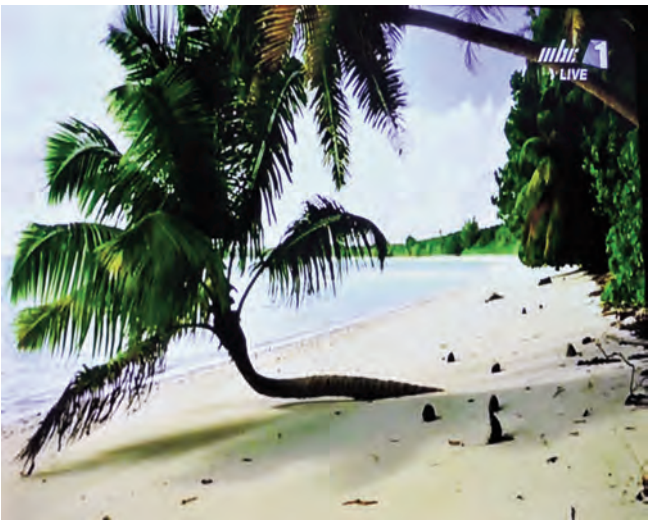
This palm tree on a Chagos beach was growing towards the sea when it changed its mind and started to move towards heaven, instead, as most trees do!

CANADA'S INTERNATIONAL SCHOOL | L'ÉCOLE INTERNATIONALE DU CANADA