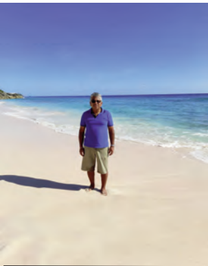
Like being at Flic-en-Flac

The island has a distinctive blend of British and American culture, which can be found in the capital, Hamilton. Bermuda is made up of a series of islands that is in the shape of a prawn. Bermuda has always been associated with the Bermuda Triangle. It is a section of the North Atlantic Ocean off North America in which more