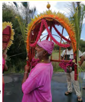
Devotee carrying cavadee to temple

The religious celebration of the Thai-poosam Cavadee was observed in Mauritius in all the Tamil temples (kovils), in town and villages, and even on mountains like Montagne Corpe de Garde at Quatre Bornes and the Colline Monneron in Port Louis.