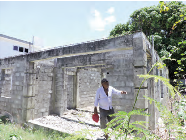
The property at Pereybere for sale built up to first floor