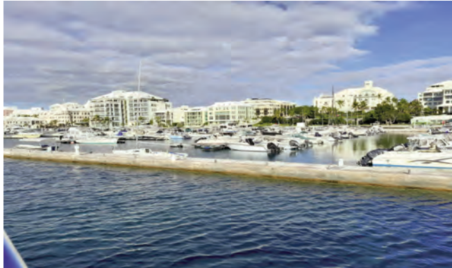
Hamilton - The Capital

Bermuda is a British Overseas Territory in the North Atlantic Ocean known for its pink-sand beaches such as Elbow Beach and Horseshoe Bay. Its massive Royal Naval Dockyard complex combines modern attractions like the interactive Dolphin Quest with maritime history at the National Museum of Bermuda.