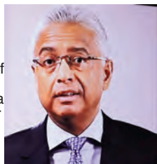
PM Pravind Jugnauth

He called them a crab basket (panier crabe) full of frustrated characters. "I am concentrating on my job to run the country and I'll continue to do so. I will not engage in cheap talk," he told the interviewer