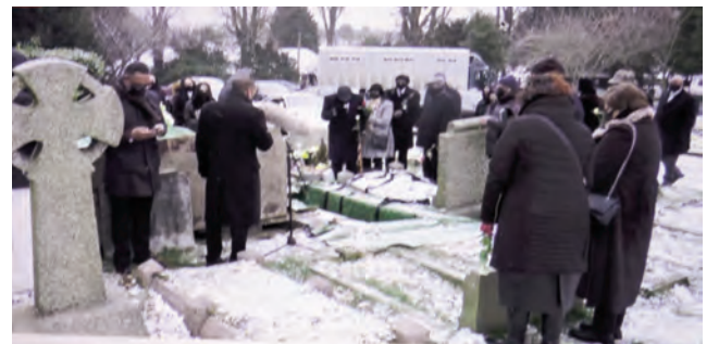
The West Croydon Cemetery ground covered with a blanket of snow