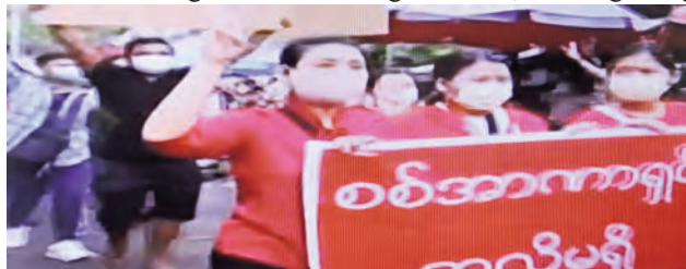
Protest march in Myanmar

In Russia, people are marching for liberation of dissident Navalny, In France, les Gilets Jaunes march through the streets of Paris against numerous grievances, in Hong Kong