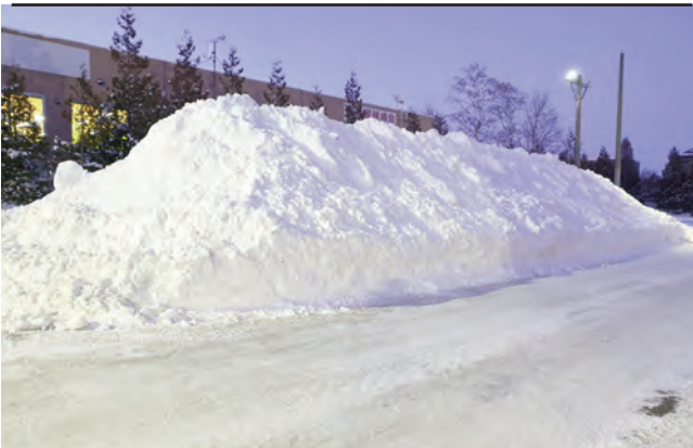
How does one live with a mountain of snow in front of one's house for days? A compatriot living in Japan has to.