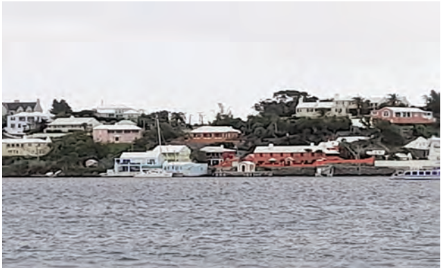
Pink Houses - White roofs

houses. Drinking water has been a concern ever since human habitation began in Bermuda. The roofs are fashioned in step-like sloped surfaces with gutter ridges funnelling water toward pipes leading to an underground tank. 50% of all the potable water consumed in Bermuda comes from their roofs. The white roofs also keep their homes cooler during the hotter months. (see photo) The quality of life for families in Bermuda is excellent. Since the place is so small, everything is reachable within a