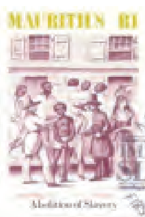
GPO postage stamp commemorating abolition of slavery

The East India Company had the monopoly of the slave trade and in the first half of the 18th century, the slaves were obtained from the West African coast. The nearby island of Madagascar also supplied a great number of slaves. When Labourdonnais began the construction of Port Louis, he introduced slaves from India and Bengal.