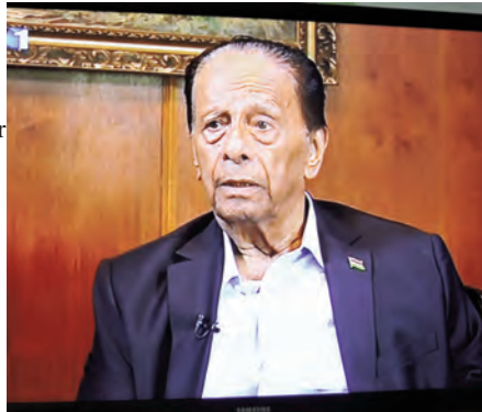
SAJ as shown on MBCTV

The former PM took the opportunity to express his thanks to the frontliners. On the other hand, thanks to the help extended by the government there has been no job loss, he said.