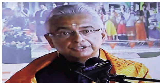
Prime Minister Pravind Kumar Jugnauth, the target man for the coffin on the left?

Corruption is today a word that is being used in every country of the world. In France many previous political figures have been indicted on corruption charges and the current one is Nicolas Sarkozy.