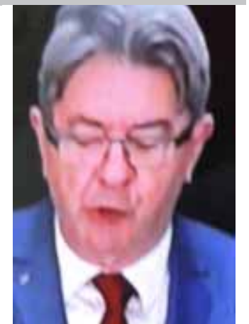
J.L. Melenchon, Next French P.M.

Among the coalition of the Left, individually, the Nouveau Front populaire (NFP) of Melenchon. leads with 182 seats. The leader contends that he should be the President of the new National Assembly and be appointed as Prime Minister. This ranking is still going on at the time of writing (18/07/24)