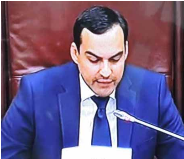
New Speaker, Adrien Charles Duval in the Chair

Rumours soon began to circulate of a rapprochement of Xavier Duval and PM Pravind Jugnauth in spite of the considerable previous mudslinging that took place between them on the opposite sides of the House. PM Jugnauth was even severely critical of the encounters with the law of Xavier Duval'