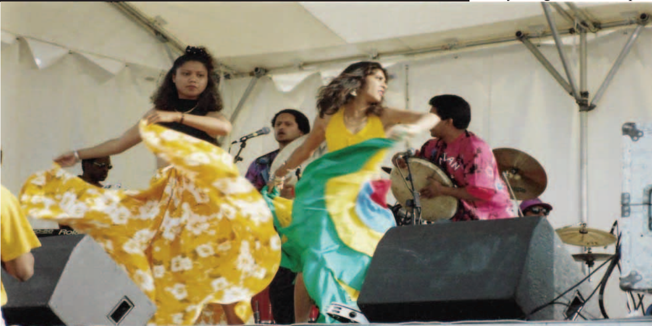
UK Mauritians dancing the sega at openair festivals in London

nursing in this country to be a good opening for a career. At one time, practically every single UK hospital