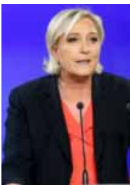
M. Le Pen We will be back

Le Pen est dans la Peine, but not déplumée