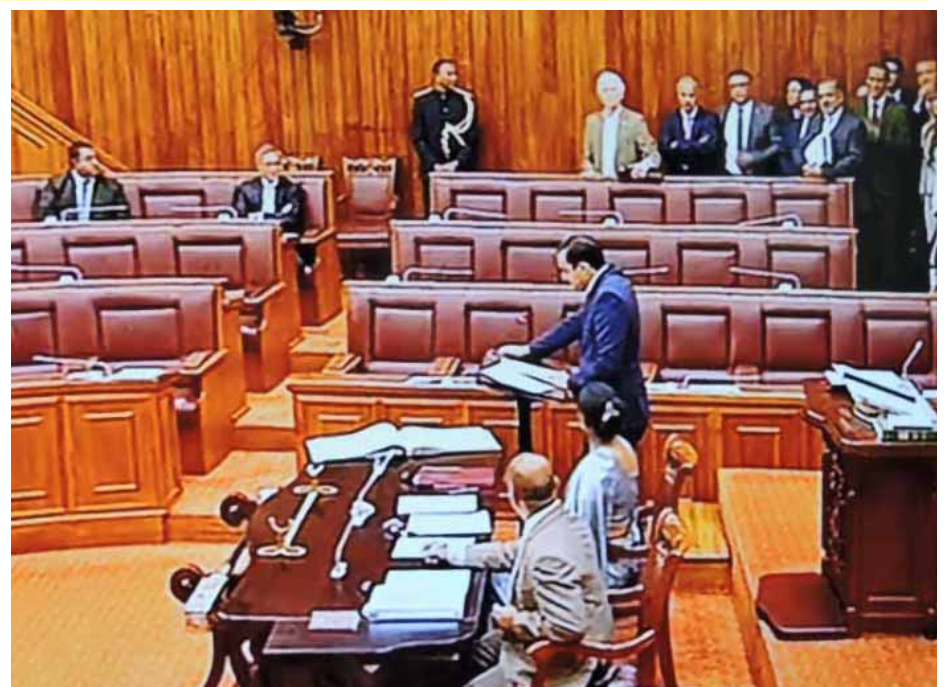
Standing Paul Bérenger (top of picture) and other demonstrators shouting during investiture ceremony)

With his Bangor University qualification, Bérenger put his Philosophy degree to good use. There is money in politics for those who hold the right portfolio. Many who came naked on the political scene, according to their own saying, ended up on the Rich List (and the very rich list too, declared or undeclared) of the island.