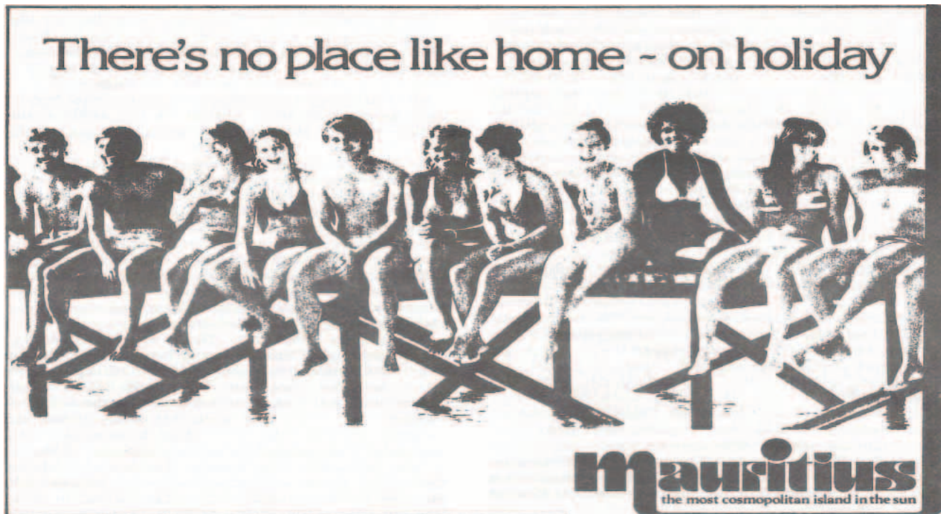
The Mauritius Tourist Office inviting UK Mauritians in the 1980s to spend holidays in Mauritius

It is with quite a bit of nostalgia that we look back on the old days of the 1960s when we experienced moments of great difficulties which some of us would sensibly like to forget. But there were also moments of satisfaction which