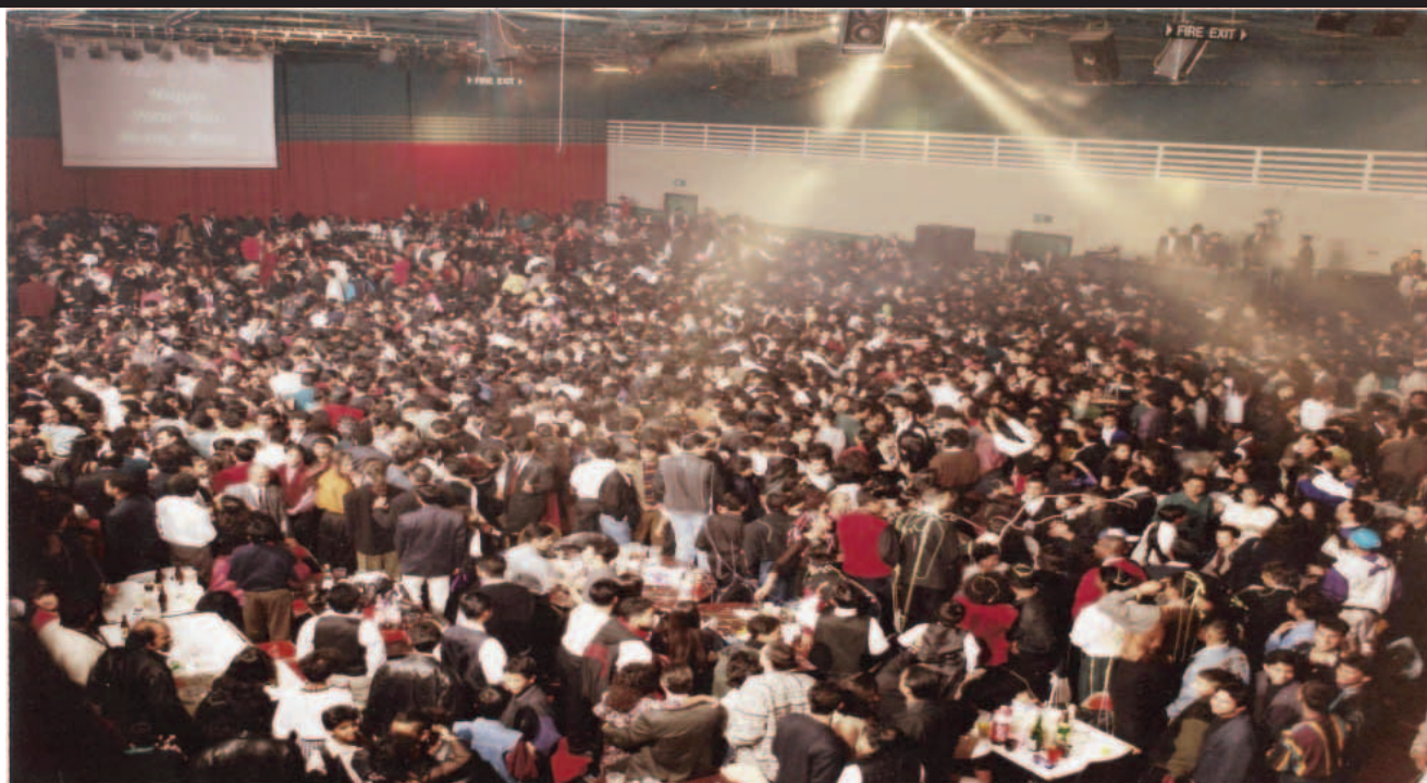
A Mauritian New Year Party in north London in the 1990s

Mauritian expatriates have often been reproached for leaving the motherland when the country faced great difficulties. The fact is that when the compatriots left Mauritius in their thousands during the 1960s (before and after independence) Mauritius was economically weak depending entirely on the revenue from sugar. Unemployment which was already a major