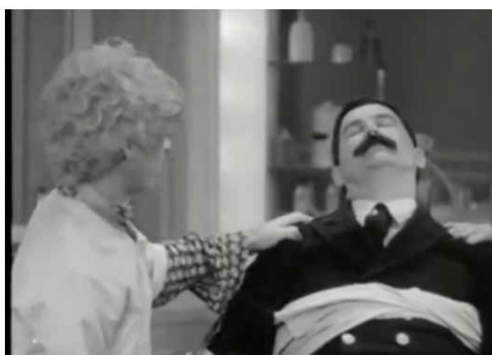
Harpo who never spoke a word (on the set at least) took a good look ....