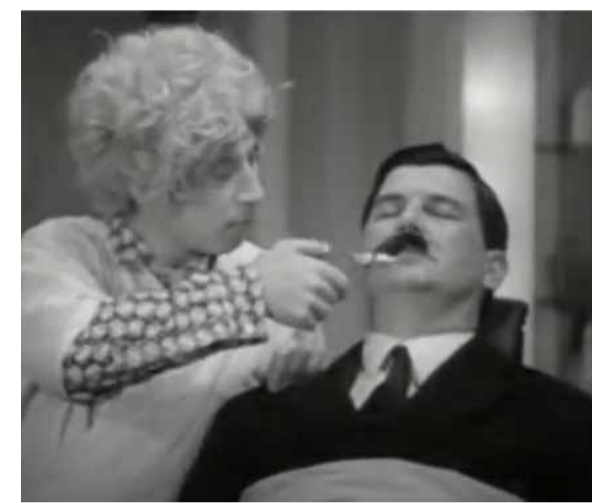
.... and carried on trimming to give the Moustachio the Hitler's touch