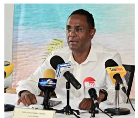
Junior Minister of Tourism Jean Sydney Pierre

(iii) 'Gran Konser' at Les Salines, Port Louis on 14 December 2024;