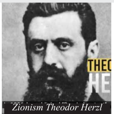
Zionism Theodor Herzl

In it, he said, the only way for Jews to avoid Europe's anti-Semitism was not just to leave, but to have their own country. And Herzl didn't just write. The next year he organized a conference in Basel, Switzerland: The First Zionist Congress. The attendees agreed on a program which sought, among other things, to establish a Jewish homeland in Palestine and promote Jewish settlement in Palestine.