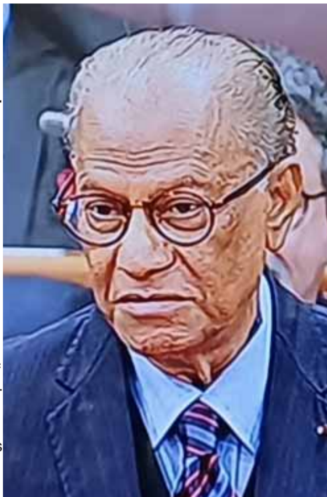
Prime Minister Navin Ramgoolam

The British may decide to comply with the rulings of the International Court of Justice and the resolutions of the United Nations General Assembly to give back the Chagos to Mauritius.