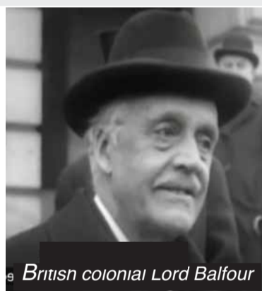
British colonial Lord Balfour

Empire is one hell of a drug. This was World War I, and the British were making lots of promises. In addition to promising a Jewish homeland in Palestine. They promised Arab leaders independence if they rose up against Britain's enemy the Ottoman Empire.