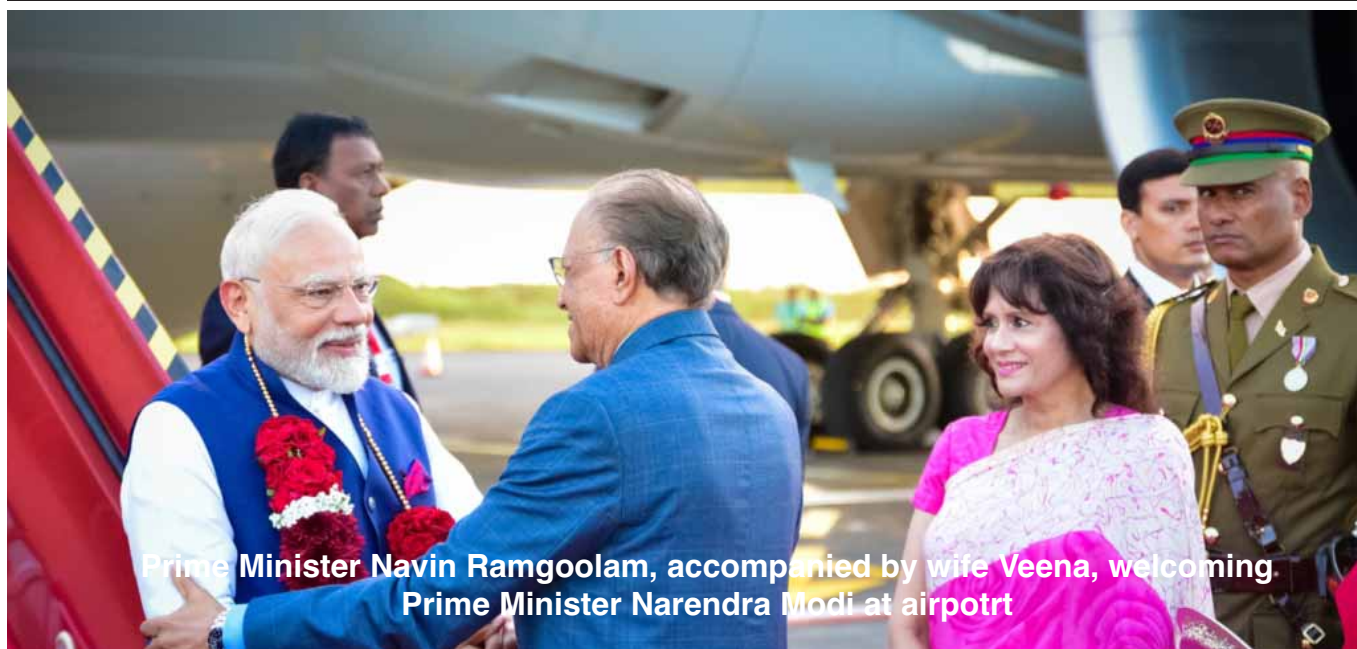
Prime Minister Navin Ramgoolam, accompanied by wife Veena, welcoming Prime Minister Narendra Modi at airport

The Prime Minister of the Republic of India, His Excellency Shri Narendra Modi, reached Mauritius arrived on 11 March 2025 on a two-day State visit. Mr Modi is the Chief Guest attending celebrations marking the 57 years of Independence of Mauritius and 33 years as a Republic. He is leading a 12-member delegation which comprise the Minister of External Affairs, Dr S. Jaishankar, and other high-level officials of the Government of India.