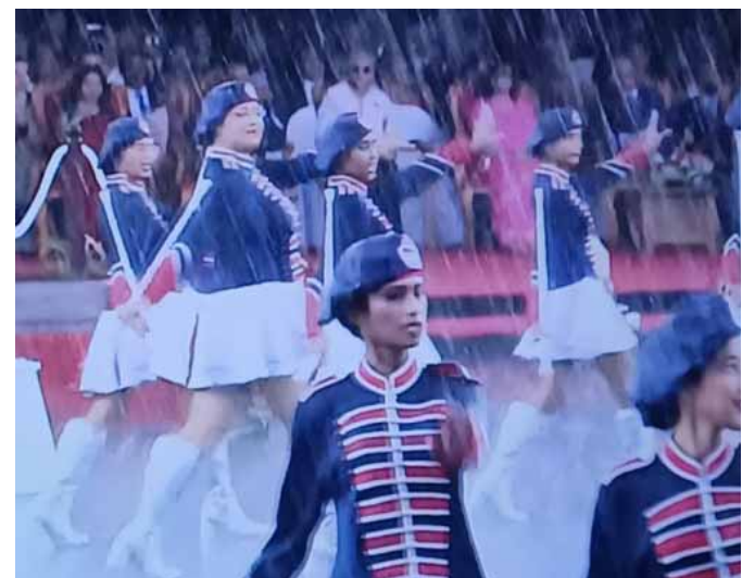
Picture on the right shows majorette parading in heavy rain