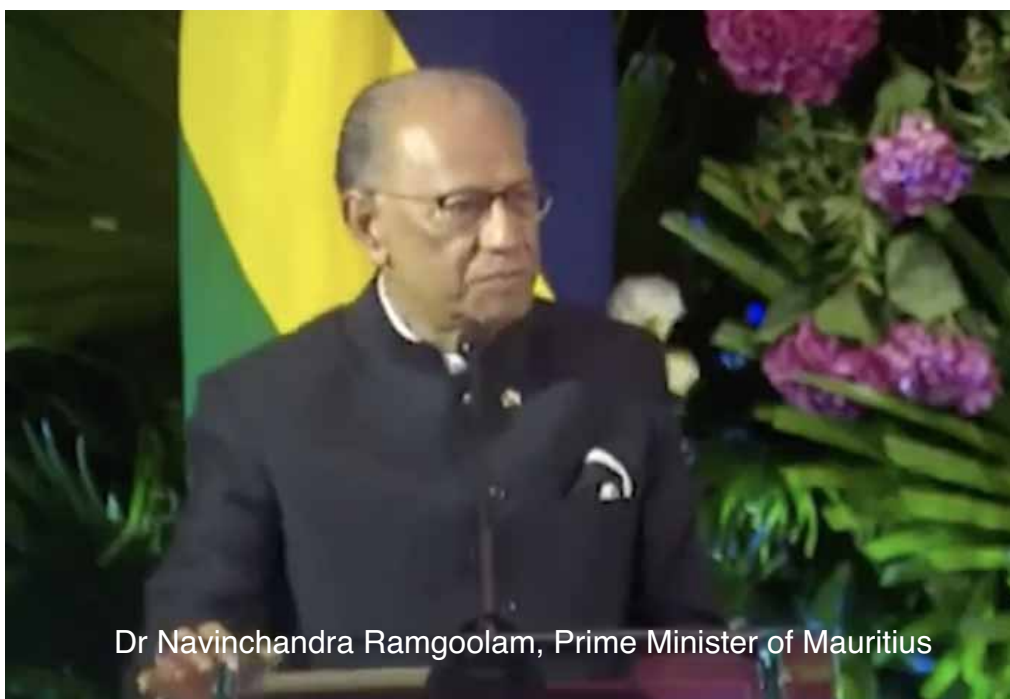
Dr Navinchandra Ramgoolam, Prime Minister of Mauritius

At a banquet on 11 November hosted by Prime Minister of Mauritius, Dr Navinchandra Ramgoolam, at the Meridien Hotel in Pointe-aux-Piments, in honour of Chief Guest Narendra Modi, Prime Minister of India, the Mauritian Prime Minister spoke for over half-an-hour of the good relations between India and Mauritius. He talked of the goodies that would be forthcoming from Mother India.