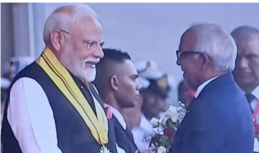
Picture on the left shows Indian Prime Minister receiving the highest honour, GOSK, from the President of the Republic of Mauritius.

Mr Modi who delivered his speech in Hindustani is reported to have said that if there is a country that can make demands on India it's Mauritius. This sums up everything he said in terms of relations between the giant and the small fry of the Indian Ocean.