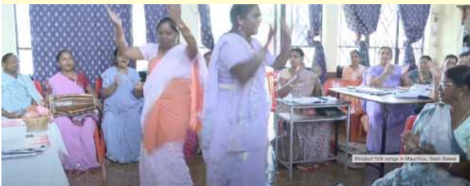
Bhojpuri Dance =

The Creole and the Bhojpuri folklores for the basis of