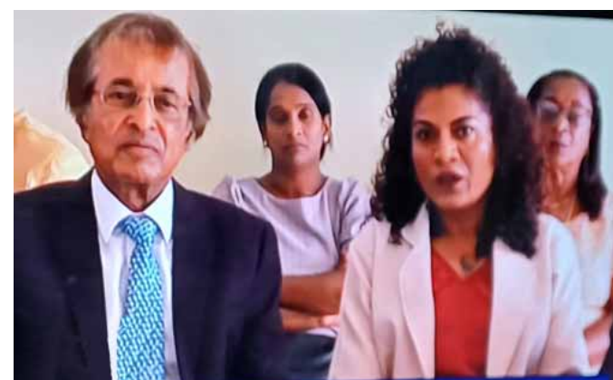
Over 40 years after being, at National Assembly level, Foreign Affairs Minister, and subsequently Health Minister, and Tourism Minister, Me Anil Gayan is now seeking election, as a municipal councillor for the Municipality of Beau Bassin-Rose Hill.

Usually, most budding politicians would make their debut in politics at local government level and work their way up. For Me Gayan, it's the reverse. After having been there at the top of local politics, he now makes a comeback starting from scratch. It is to be wondered whether he is the first Mauritian politician to be so engaged.