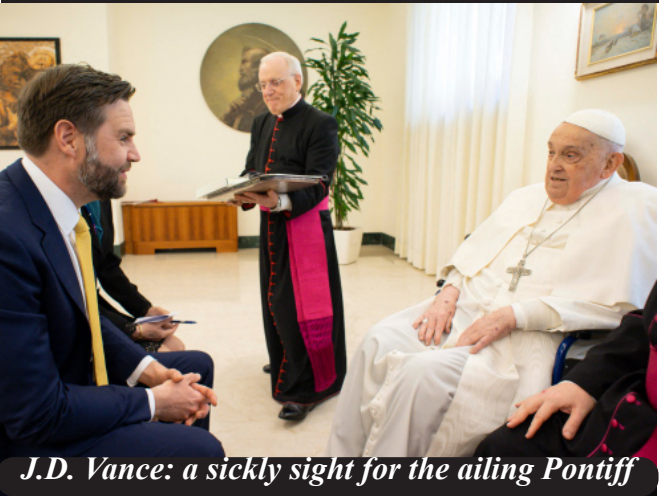
J.D. Vance: a sickly sight for the ailing Pontiff

A very courageous dying Pope Francis agreed to receive Vice President J.D. Vance at the Vatican on Easter Sunday (27/4/25) only a few hours before his demise.