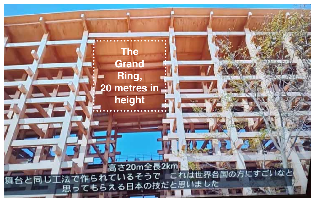
The Grand Ring, 20 metres in height

高さ20m全長2km 舞台と同じ工法で作られているそうで これは世界各国の方にすごいなと思ってもらえる日本の技だと思いました