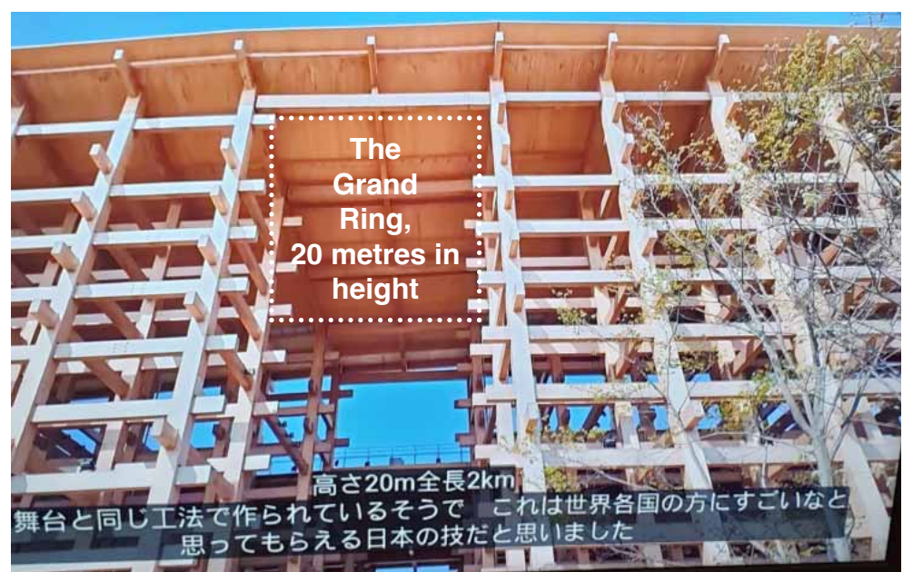
The Grand Ring, 20 metres in height

高さ20m全長2km 舞台と同じ工法で作られているそうで これは世界各国の方にすごいなと思ってもらえる日本の技だと思いました