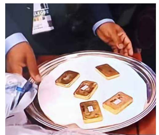
Part of the 45 gold ingots restituted