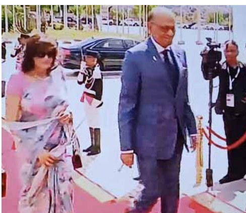
Prime Minister Navin and Mrs Veena Ramgoolam arriving at Summit

The Mauritian delegation was headed by Prime Minister Navin Ramgoolam