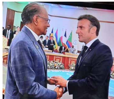
Dr Navin Ramgoolam meeting French President Emmanuel Macron

Thematic Round Tables were held during the Summit, allowing focused discussions between Member States and stakeholders. During the Round Table on food security, connectivity and