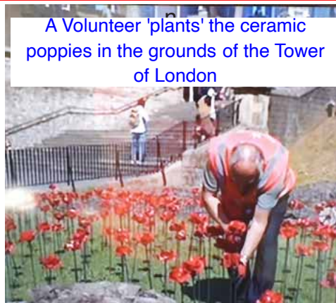
A Volunteer 'plants' the ceramic poppies in the grounds of the Tower of London

In November 2014, "Blood Swept Lands and Seas of Red" was an art installation in the Tower of London moat that ran from July to November to honour the 100th anniversary of the start of WW1.