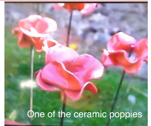
One of the ceramic poppies