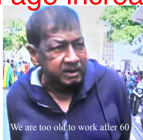
We are too old to work after 60