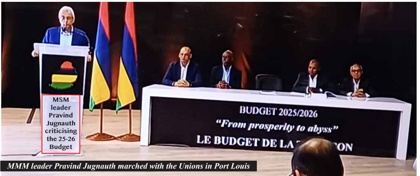
MMM leader Pravind Jugnauth marched with the Unions in Port Louis

where the shoe pinches. The explanation comes too late. The unannounced decision, without any previous warning, is considered to be a blunder on the part the new Government.