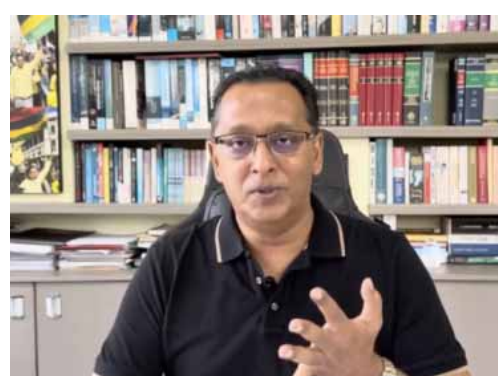
Roshi Bhadain, Party leader, counting broken promises