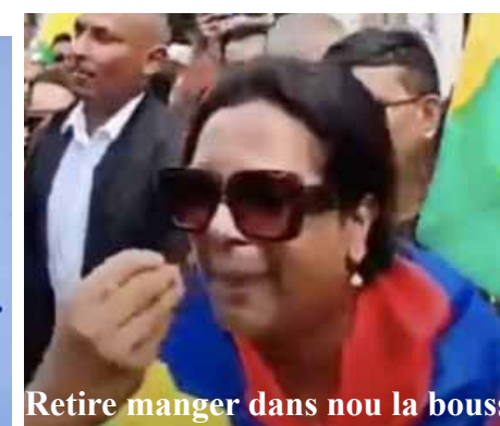
Retire manger dans nou la bouss

Parti Rodriguais Travailler Democrate P.R.T.D Nous pé dir nou bane dirigent vine cause la verité avec peuple rodriguais concernant pension retraite 65 ans