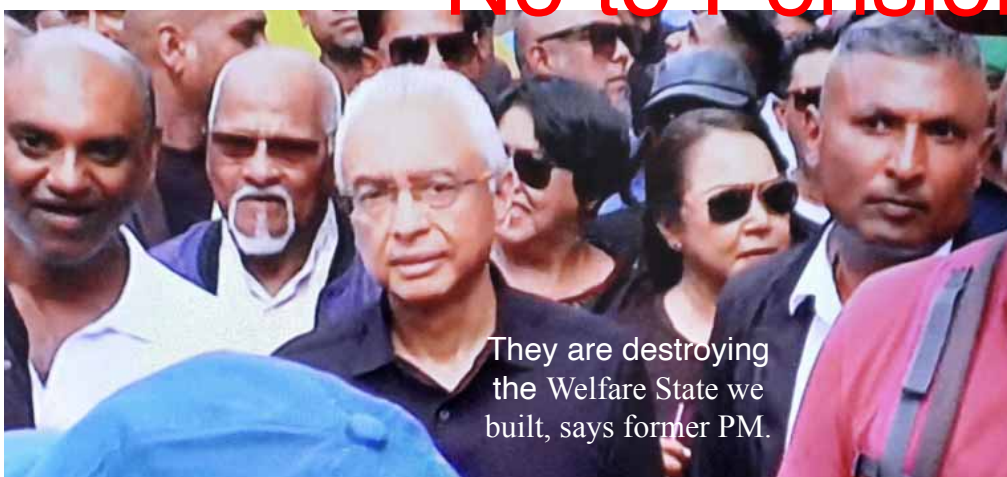
They are destroying the Welfare State we built, says former PM.