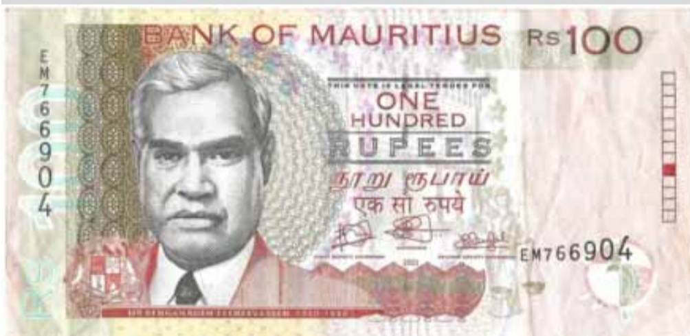
A fitting tribute to a 'Tribun': The country's one-hundred-rupee bank note bears the image of Renganaden Seeneevassen