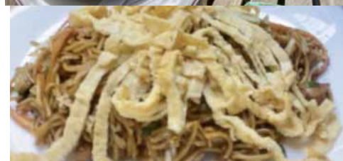
Mauritian menu at the Mangé des Îles Restaurant in Tooting Bec