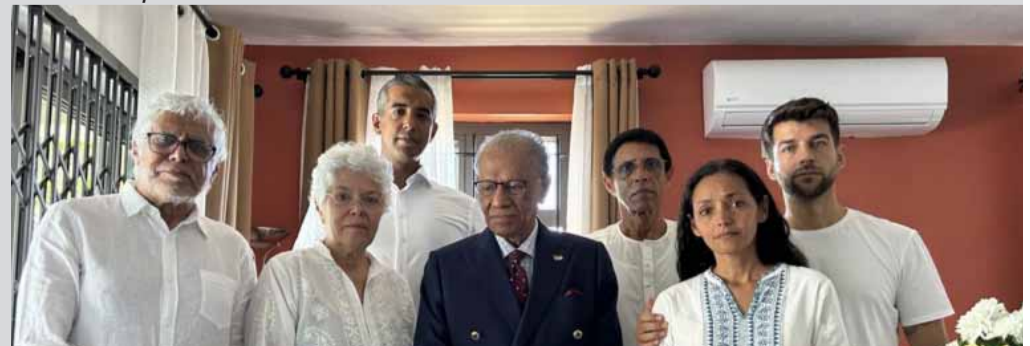
Prime Minister Dr Navin Ramgoolam en recueillement with the family