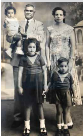
From the family album, picture of the parents with the young children