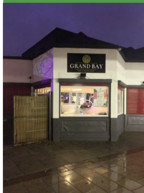
The Grand Bay venue in Crawley, South-East England