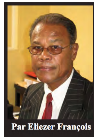
Par Eliezer François

Covid-19 : pourquoi le nouveau variant s'appelle-t-il Omicron ?