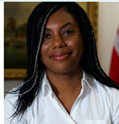
Minister for Women and Equalities Kemi Badenoch