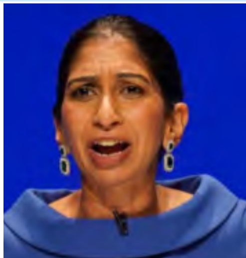
Home Secretary Braverman