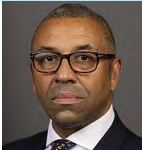
Foreign Affairs Minister James Cleverly