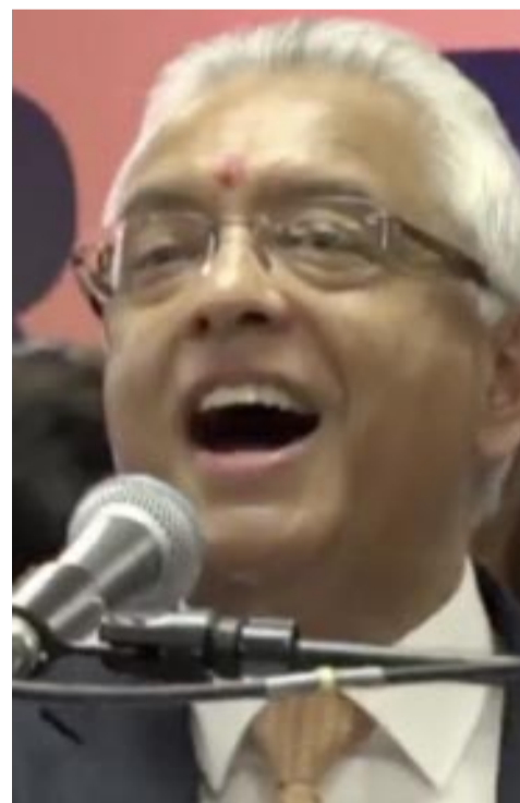
Former undergraduate of Nottingham University

Following Navin Ramgoolam appointment as PM in 1995 Mauritius News attended his press conference in London organised by the then Mauritius High Commissioner, Sir