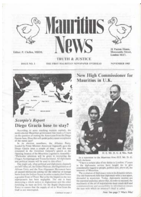
Issue No 01 November 1983

If as record shows that the first newspaper in Mauritius was created in January 1773, it is not inappropriate to place on record that the first Mauritian newspaper outside Mauritius, Mauritius News, was created in London in November 1983