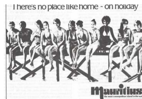
KPHS advert in Issue No 1

The paper also carried interviews with personalities from home, including Sir Anerood Jugnauth, Prime Minister of Mauritius. Mauritius News once received a communication from the University of Nottingham about one their former students who had made his mark on the political scene in Mauritius. That student was Pravind K. Jugnauth, now Prime Minister of Mauritius. It is to be wondered whether the University is now aware of the former student's distinction on the international scene.