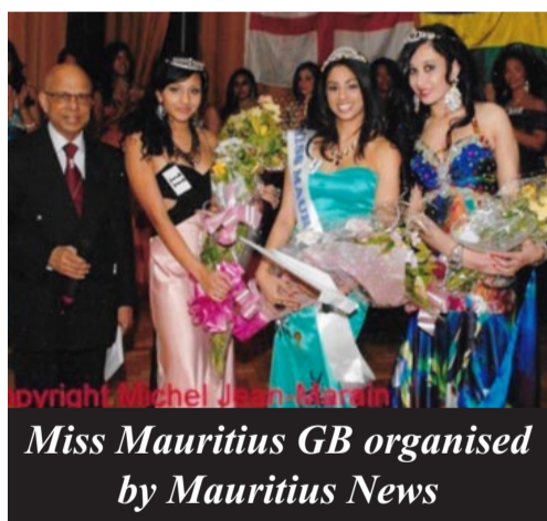
Miss Mauritius GB organised by Mauritius News

Years and years later after MN had been on the scene in the UK, there appeared in 2009,