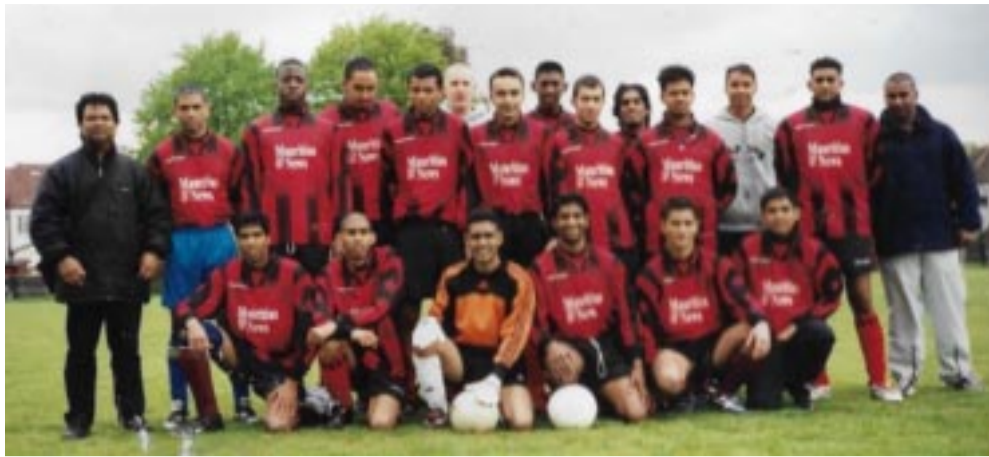
Mauritius Football team sponsored by Mauritius News

It is not inappropriate to state that according to media statistics, it is reckoned that every copy of a newspaper is read by four persons. On the strength of this figure, it may be inferred that Mauritius News, with a monthly print run of 5,000 copies, had a readership of some 20,000 fans. And perhaps more! I once