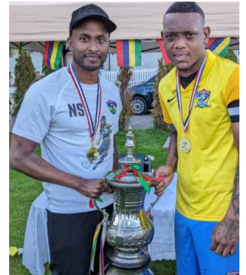
Cup in hand

fly into crunching tackles. There is no holding back. The battle for that much coveted trophy begins and the camaraderie disappears.