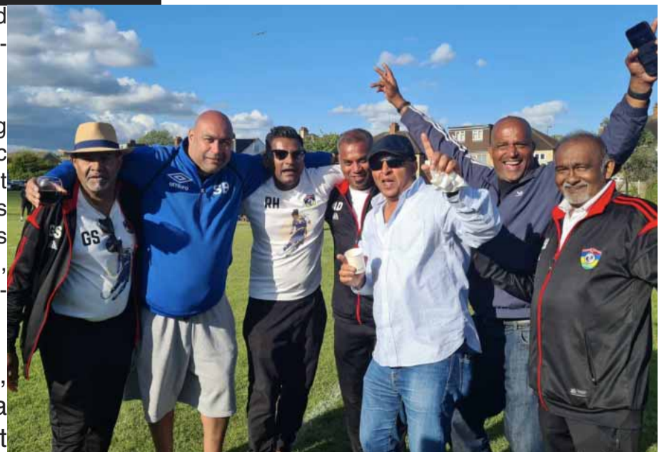
Elated fans of Cosmos FC in rejoicing mood

Meanwhile Royal Sporting, a new comer, held on to a magnificent draw against Club Des Iles. This draw would prove crucial. Limit-