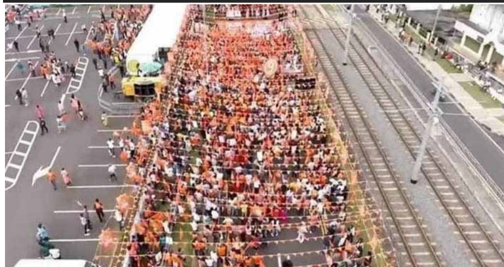
Crowd assembled on platform at train-free station

Was it a wise decision to remove the Metro Express from circulation until 2pm on May 1?