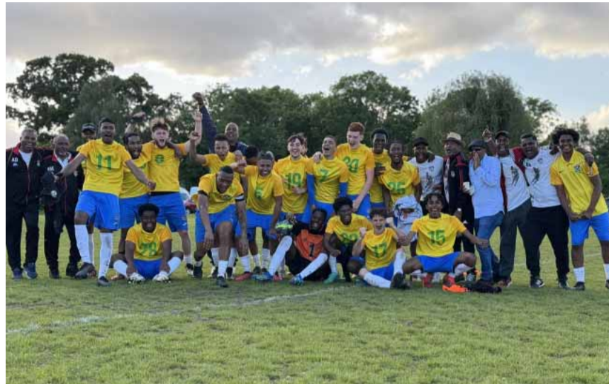
Cosmos FC players with supporters

As the day unfolds, the rain's whispers fade, replaced by a symphony of light. Bathed in the sun's golden embrace, the earth rejoices. Every leaf, every blade of grass, glistens with brilliance. The sun, in its full glory, reigns supreme, bestowing upon us a warmth that seeps into our souls. The scene is set.