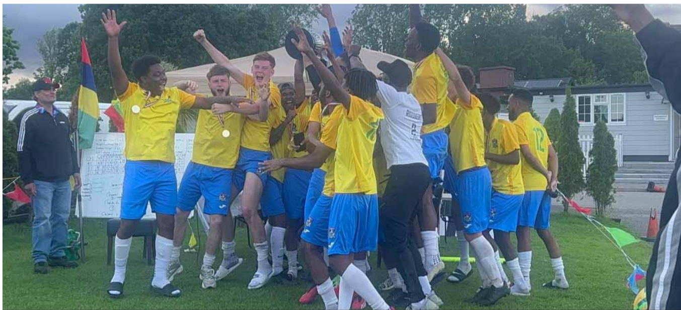
Cosmos players rejoicing, holding the Challenge Cup