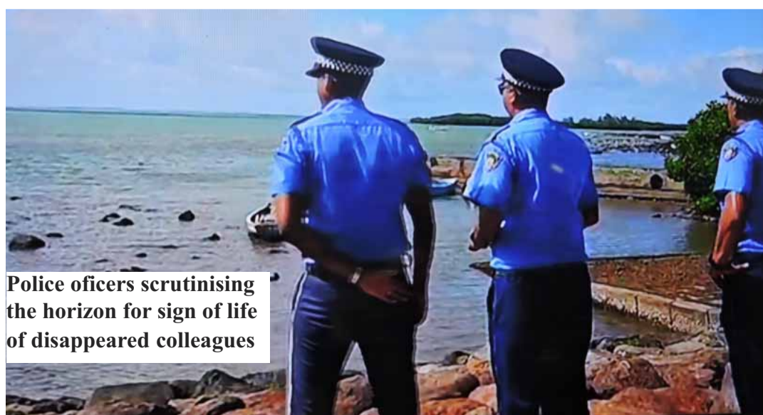
Police officers scrutinising the horizon for sign of life of disappeared colleagues

It may be pointed out that for over two months now, Mauritius has been in the grips of numerous anti-cyclones resulting in strong wind and even heavy rainfalls. Almost everyday the meteo authorities are warning the population that "all sorties en mer sont déconseillées." Not a day goes without these warnings being broadcasted on radio and tv. It is very surprising that policemen who should ensure that those warnings are observed should themselves be victims of such a drama.