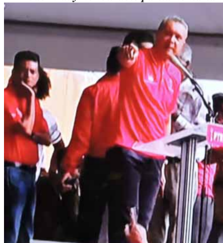
A modern-day honourable parliamentarian