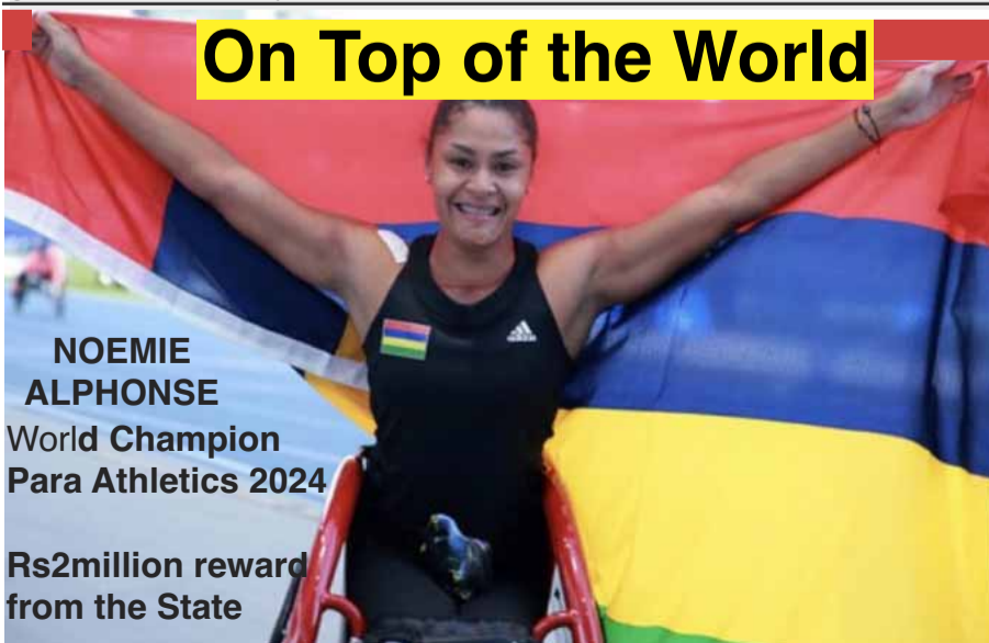
NOEMIE ALPHONSE World Champion Para Athletics 2024 Rs2million reward from the State