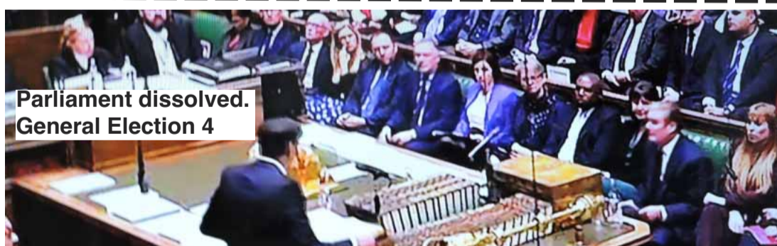
Parliament dissolved. General Election 4

It is feared that other groups in the UK may be tempted to create their own parties based on their communal appurtenances. The war of religion may not be over yet in Britain.