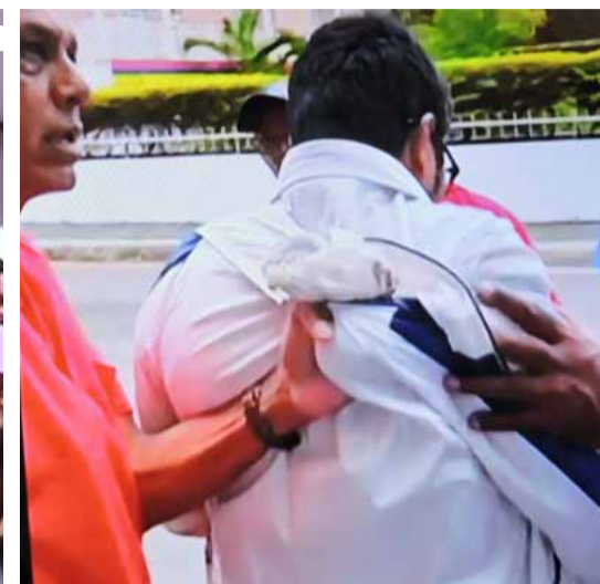
Role Models for next generation

Was it a wise decision to remove the Metro Express from circulation until 2pm on May 1?