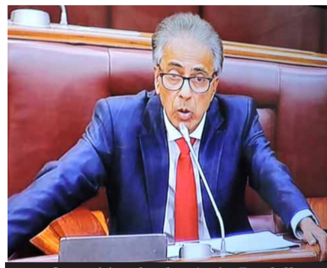
Opposition leader Arvin Boolell

It would be a quite a task to sum up in a short article the contents of a speech of 2 1/2 hours and some 50 pages. Some measures that have been widely acclaimed may be condensed for easy digest. To boost