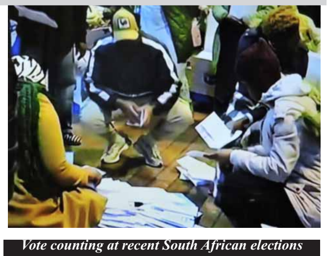
Vote counting at recent South African elections