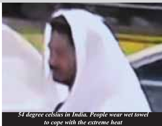
54 degree celsius in India. People wear wet towel to cope with the extreme heat