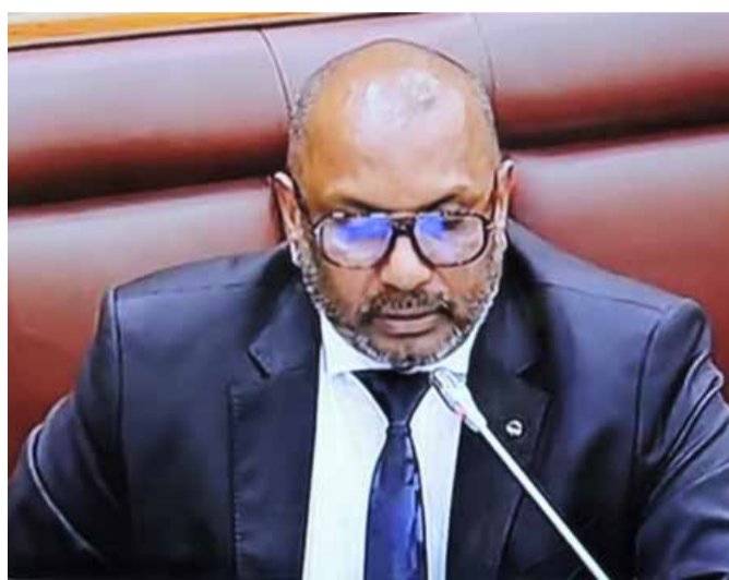
Finance Minister Renganaden Padayachy

Tomorrow is ours, it is with such conviction that Finance, Economic Planning and Development Minister Renganaden Padayachy spelt out, in his Budget Speech to the National Assembly on June 7, the measures the Government would implement during the Financial Year 2024-25. This the fifth and last budget of the Government mandate, he pointed out.