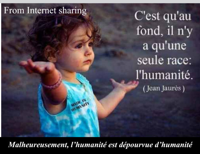
From Internet sharing

C'est qu'au fond, il n'y a qu'une seule race: l'humanité. (Jean Jaurès)