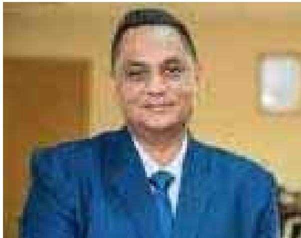
Former Minister and MP Vikram Hurdoyal

Criticism has been levelled against the PM to hold a