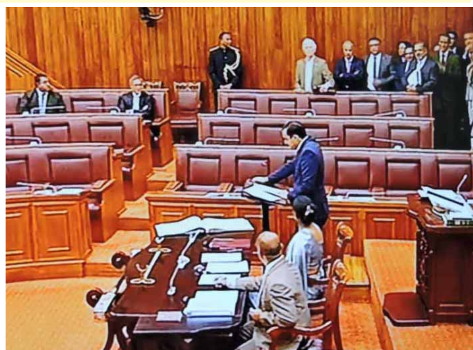
Standing Paul Bérenger (top of picture) and other demonstrators shouting during investiture ceremony)

With his Bangor University qualification, Bérenger put his Philosophy degree to good use. There is money in politics for those who hold the right portfolio. Many who came naked on the political scene, according to their own saying, ended up on the Rich List (and the very rich list too, declared or undeclared) of the island.