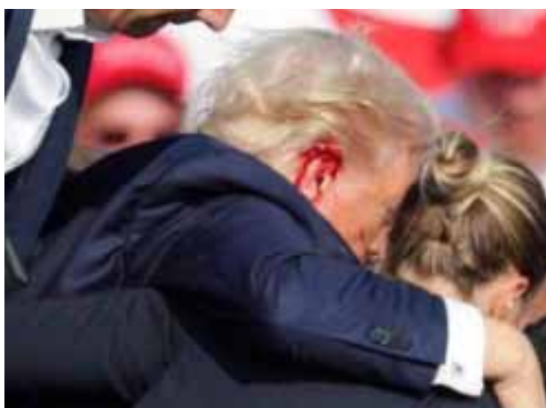
Trump's ear blast

2024 may certainly be termed Elections Year with The Elections Year with general elections scheduled to take place in 64 countries, from Algeria to the US, including Mauritius of course, within those 12 months, according to the US publication TIME.