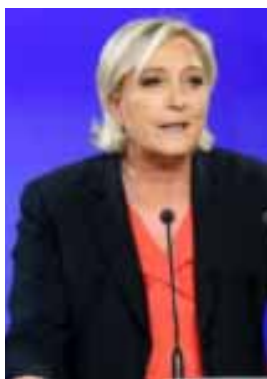
M. Le Pen We will be back

Le Pen est dans la Peine, but not déplumée