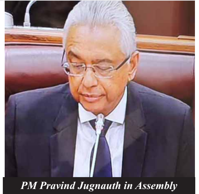
PM Pravind Jugnauth in Assembly

by-election at considerable expense to the State in the wake of the General Election. From the same quarters, fears were expressed at the time of the seat becoming vacant that the PM would not hold a by-election to avoid censure prior to the general election.