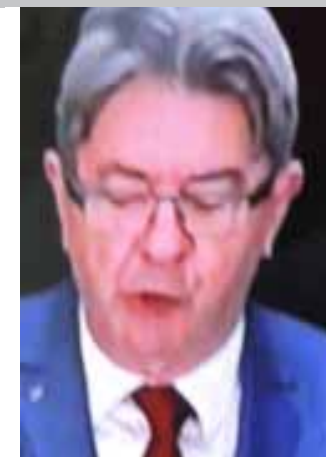
J.L. Melenchon, Next French P.M.

Among the coalition of the Left, individually, the Nouveau Front populaire (NFP) of Melenchon. leads with 182 seats. The leader contends that he should be the President of the new National Assembly and be appointed as Prime Minister. This ranking is still going on at the time of writing (18/07/24)