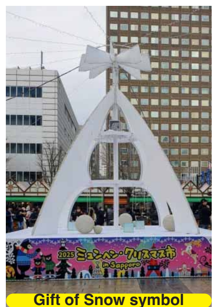
Gift of Snow symbol