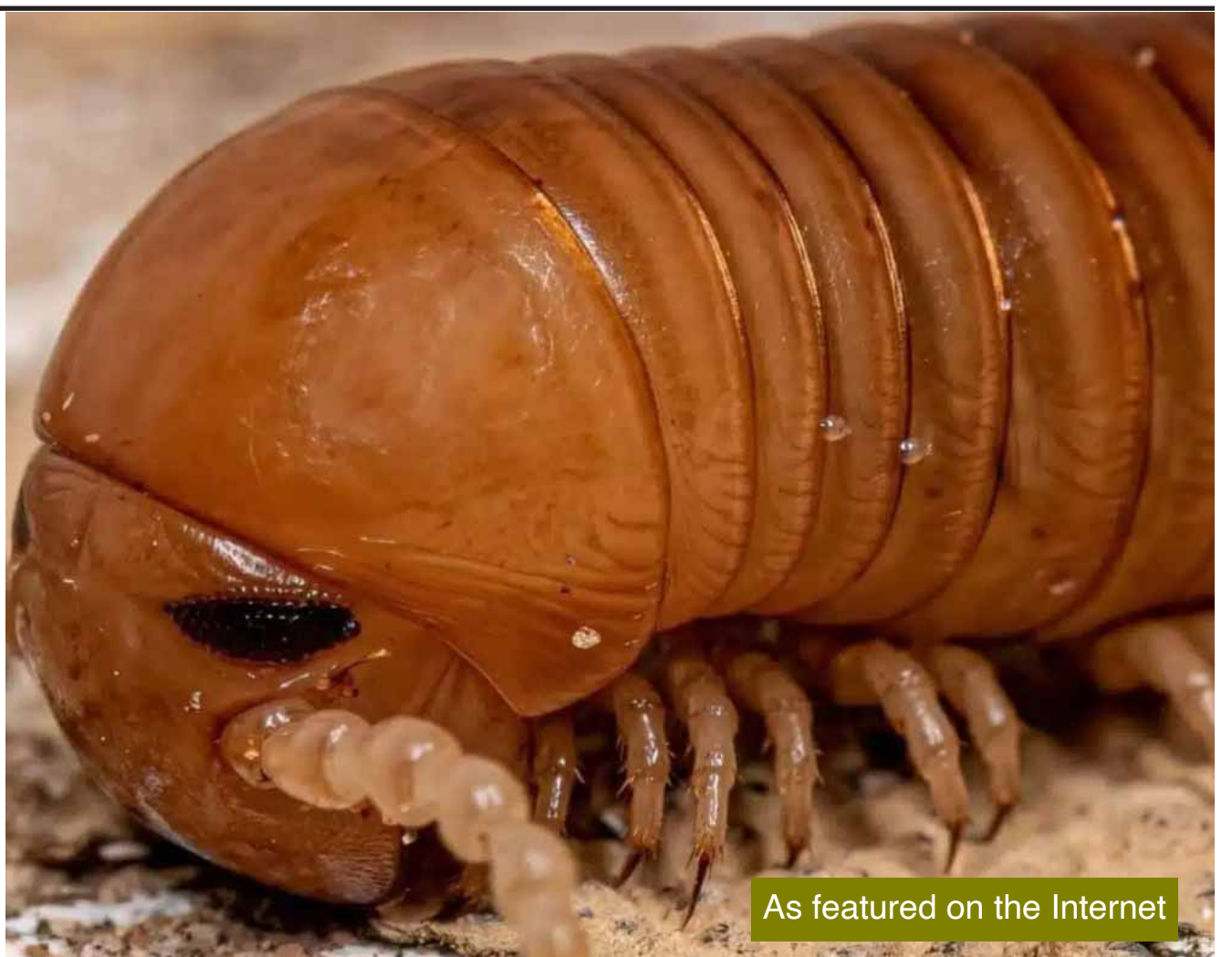
As featured on the Internet

But Others like them will spring up! But the consolation is that Planet Earth itself will be consumed with all the Trumps, Putins and Nettanyahus in it.