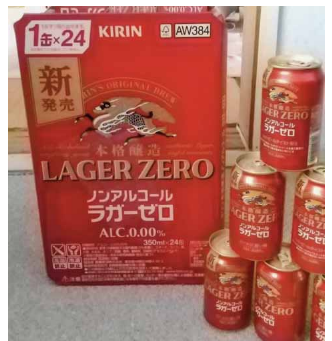
Supermarket shelves full of non-alcohol beer. Zero or the symbol of zero indicates no alcohol

My weight did go up at first, but it eventually settled back to what it was before I abstained. My body fat count has dropped a peg or two, though I wouldn't mind seeing it fall a little further.