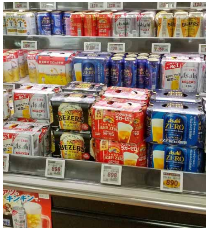
Top shelves a mixture of canned non-alcohol drinks: Lemon sour and cocktails at very affordable prices

Do I sleep better? Not really, it's more or less the same. Do I have more energy? Absolutely, and I've saved money too. That alone is a win