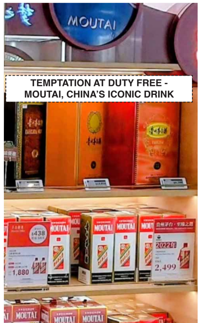
TEMPTATION AT DUTY FREE - MOUTAI, CHINA'S ICONIC DRINK