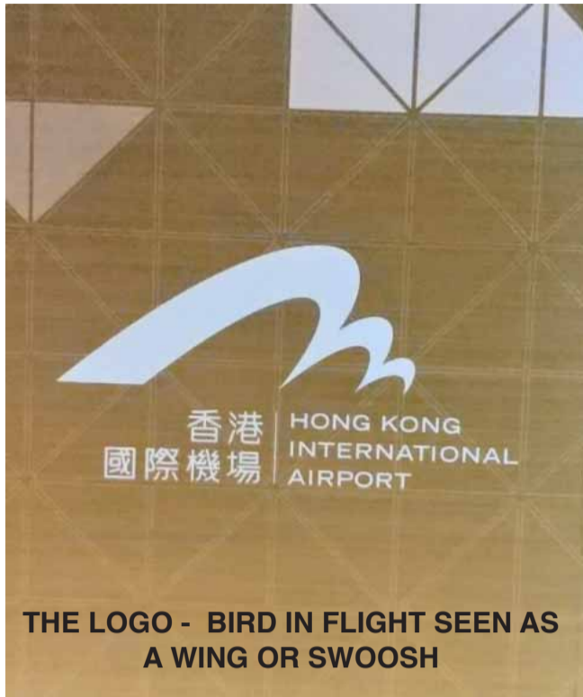
THE LOGO - BIRD IN FLIGHT SEEN AS A WING OR SWOOSH

If you're flying long-haul with Cathay Pacific, chances are you'll pass through Hong Kong International Airport at some point. I've been through many times now, and it's one of those airports that always feels clean and well organized.