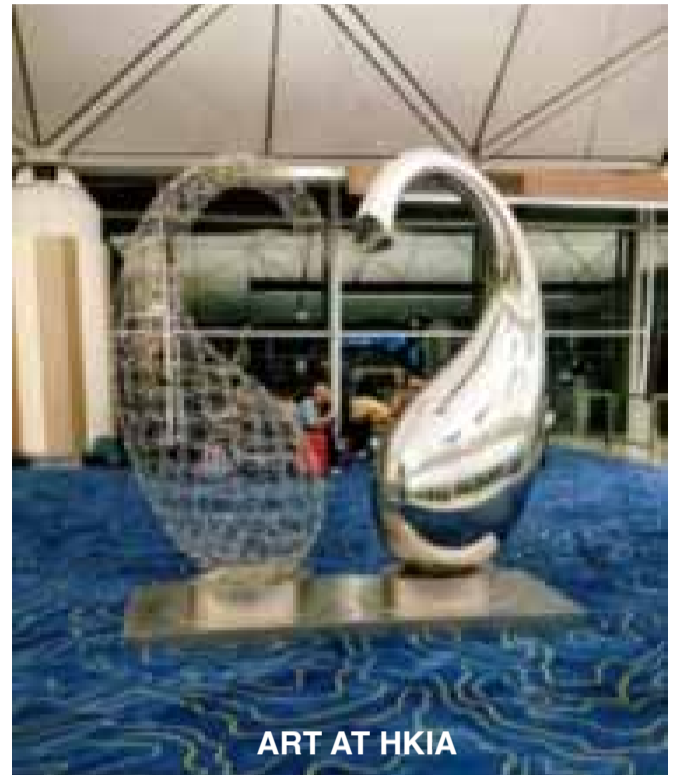
ART AT HKIA

All around, there are flowers and art placed just so, creating the feeling of space without clutter. Quite impressive, really, for an airport that is the busiest in the world for cargo and still ranks among the top ten for passenger traffic.