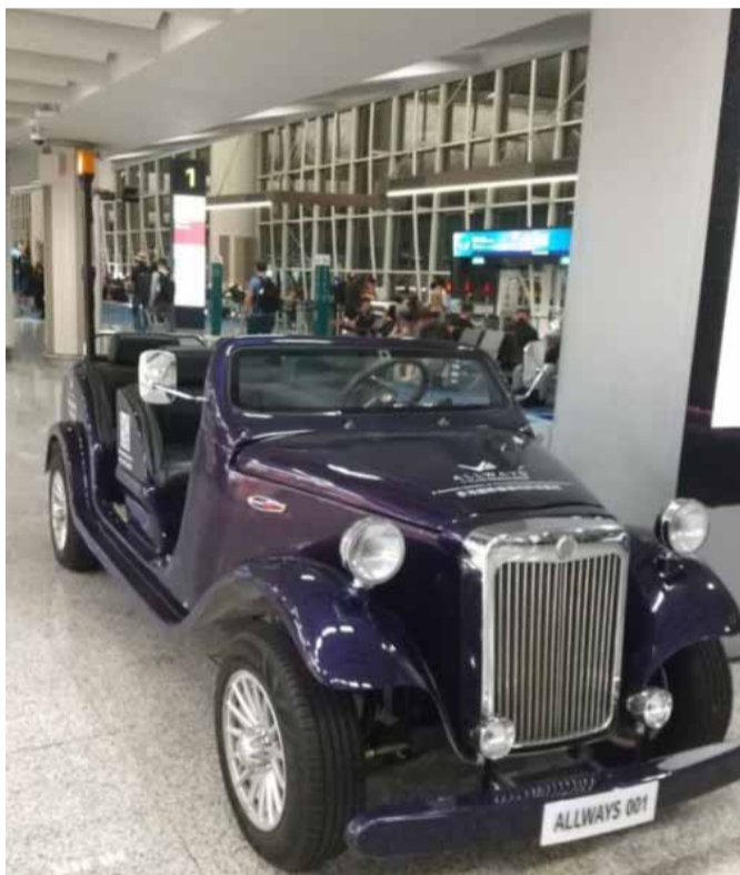
THE "ALLWAYS" ASSISTANCE BUGGY, COMBINING VINTAGE STYLE WITH MODERN AIRPORT