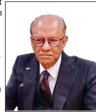
Dr Navin Ramgoolam, Premier and Finance Minister