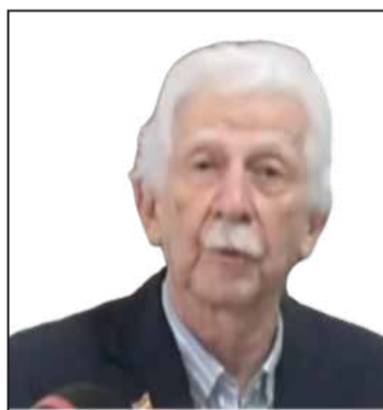
Paul Bérenger Former Deputy PM, leaving sinking ship?

But now in April, on the ground of the American objection he has reneged on his decision. He seems to have been influenced at home by characters of the Conservative Party, of whom racist Enoch Powell wanted to rid Britain, like Pretty Patel and beauty Kemi Badenoch. These True Blue elements of the Party, plus the Farage character, are opposing any deal with Mauritius. They have made it known that when they will be in power, they will not pay any money to Mauritius because Britain is itself bankrupt and is raising pensionable age to 70. The Conservatives will, without any doubt, win the next general election in Britain. To coax the elec-