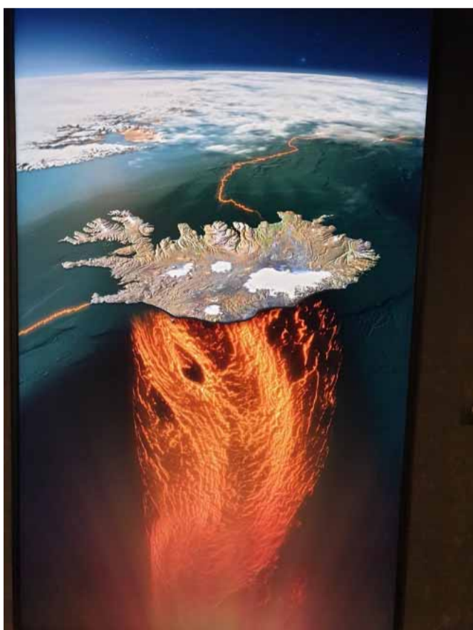
A visualization of the column of fire beneath Iceland

Often called the Land of Fire, it was this mix of heat and ice that drew me in. With a population of around 400,000, it feels vast, open, and refreshingly uncrowded.