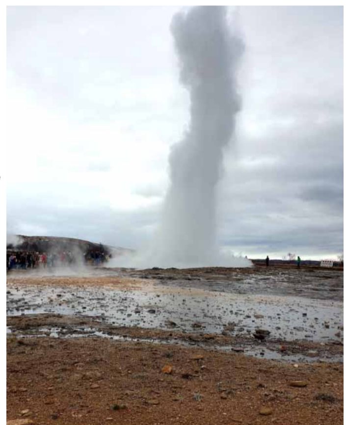
Grey Strokkur erupting

For instance, while it may only be a 40-50min drive from the capital to the Blue Lagoon, taking the scenic route to enjoy the most spectacular views, can easily turn into a two hour journey.