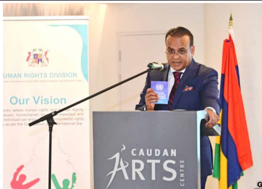
The Minister of Foreign Affairs, Regional Integration and International Trade, Mr Dhananjay Ramful launching the publications

The Human Rights Division, operating under the aegis of the Ministry of Foreign Affairs, Regional Integration and International Trade, convened the annual National Mechanism for Reporting and Follow-up meeting on 30th April, in Port Louis, to review progress and reinforced efforts to ensure Mauritius meets its international human rights obligations.