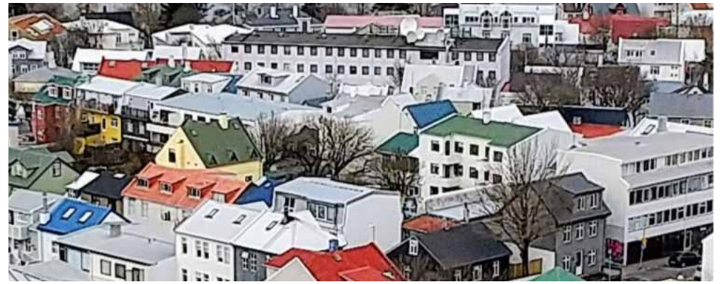
Black volcanic stones in contrast to the brightly painted houses

It's just a two and a half hour flight from Manchester to Reykjavik, the capital of Iceland. Sitting on a volcanic hotspot, the island is packed with dramatic landscapes - volcanoes, lava fields, geysers, waterfalls and glaciers.