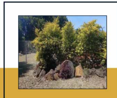
Quiet, green, and peaceful