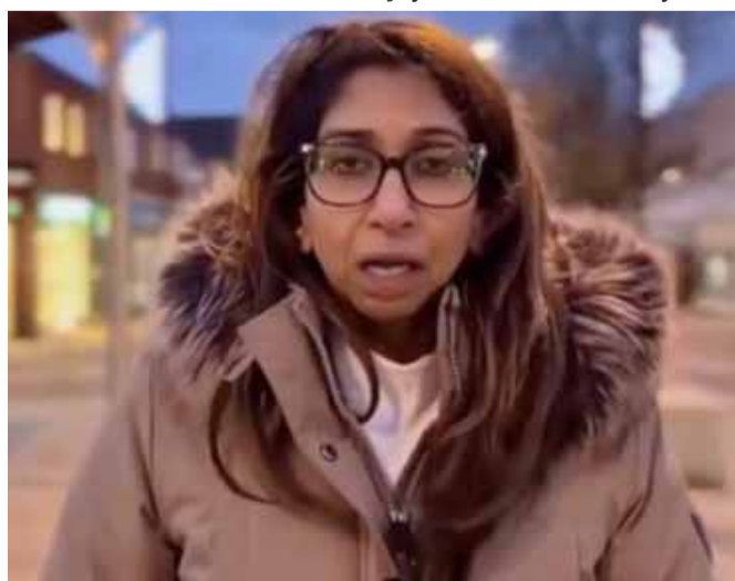
Reform UK MP Mrs Suella Braverman

duck, and that under him the Labour Party would be wiped out of Government at the next general election. There are now elements in his own Labour Party who are expressing this view and want him replaced.