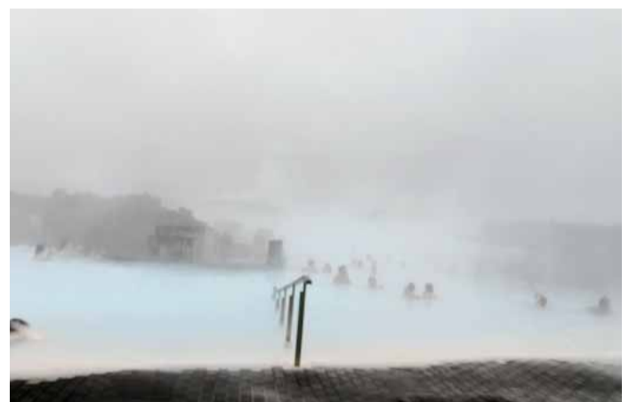
The Blue Lagoon Thermal Water

And once you arrive, it's not just a quick stop. You can spend hours soaking in the warm thermal waters, then into the cafe for something to eat. You can even stay overnight, something a rushed tour simply can't do justice.