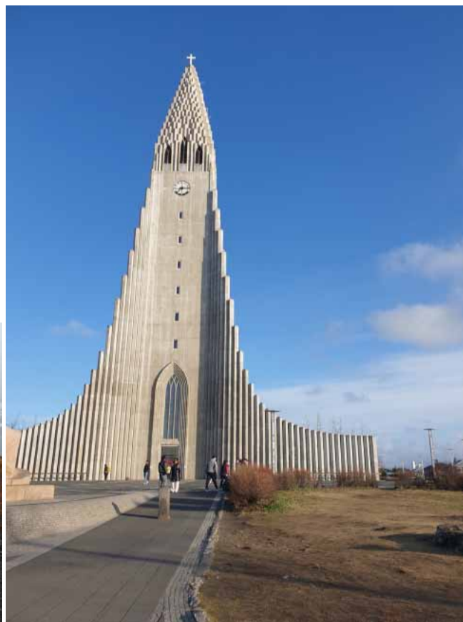
Hallgrímskirkja Church inspired by lava flow and basalt columns