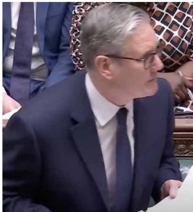
Prime Minister Keir Starmer being quizzed in the Commons on the appointment of Peter Mandelson as Ambassador to the US

Wherever, the Cambridge legally-trained lady got that idea? She should still have in mind Starmer’s anti-semitism campaign against Jeremy Corbyn no sooner he took over from him the leadership of the Labour Party in 2020.