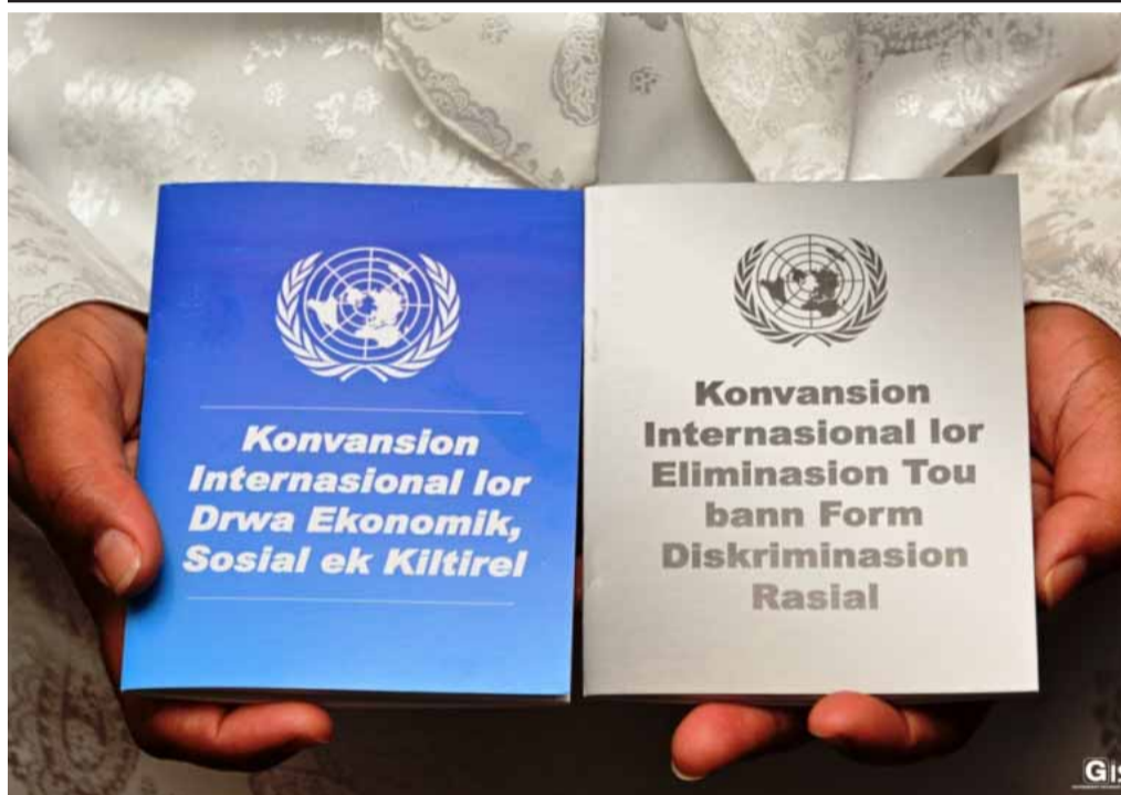
Two booklets in Kreol Morisien on the Convention to eliminate all forms of racial discrimination